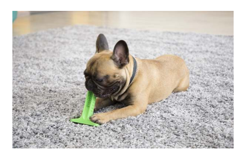
Dental Care Chew Toys

There is a wide range of chew toys and dental treats available for both cats and dogs that can help to keep their teeth clean.